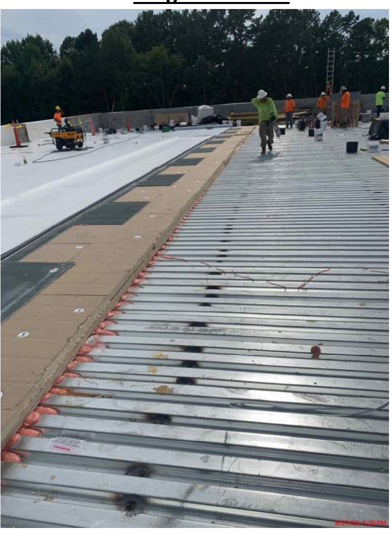
Area C-Gym roof being installed