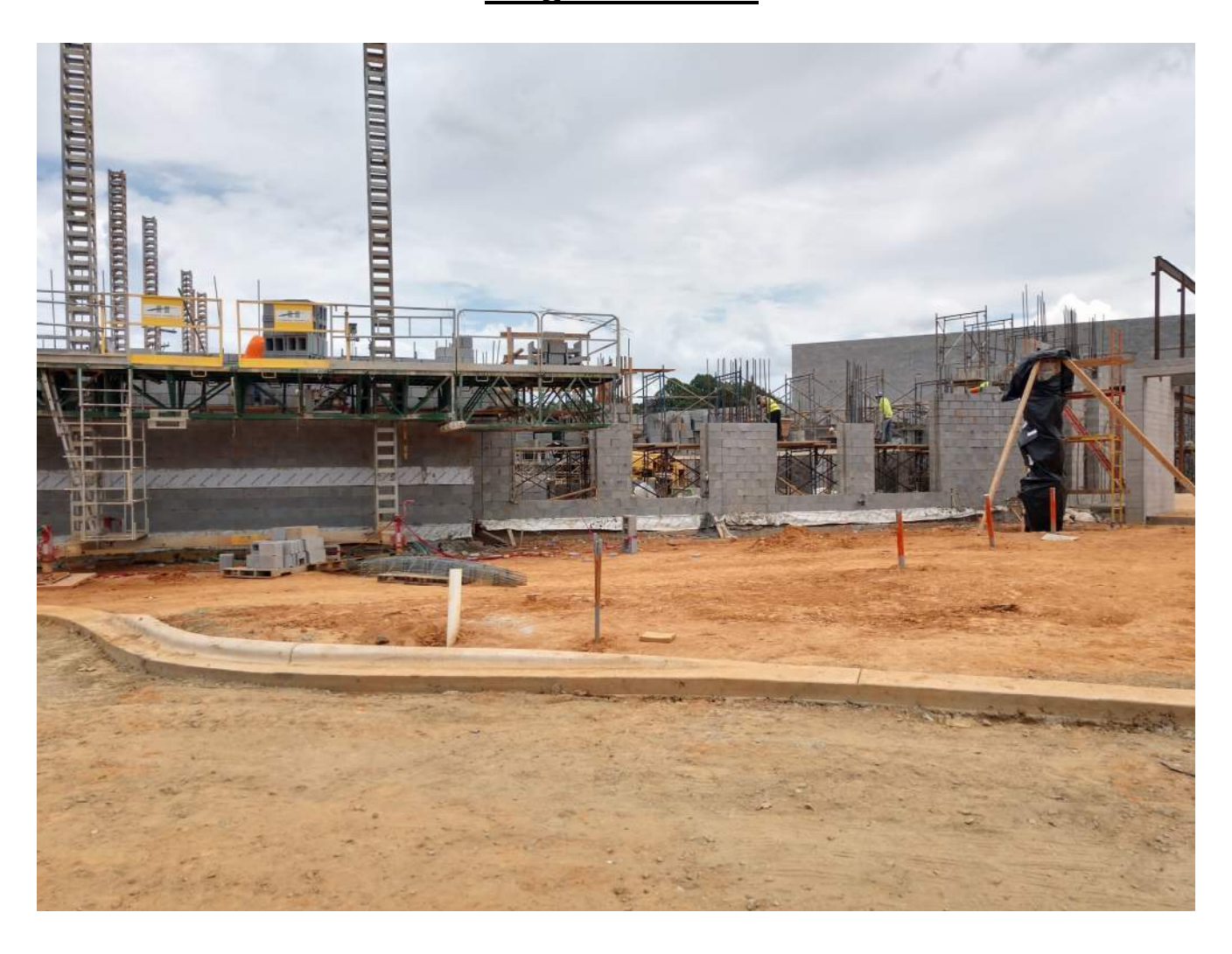
Area B-CMU continues in Leisure Pool.