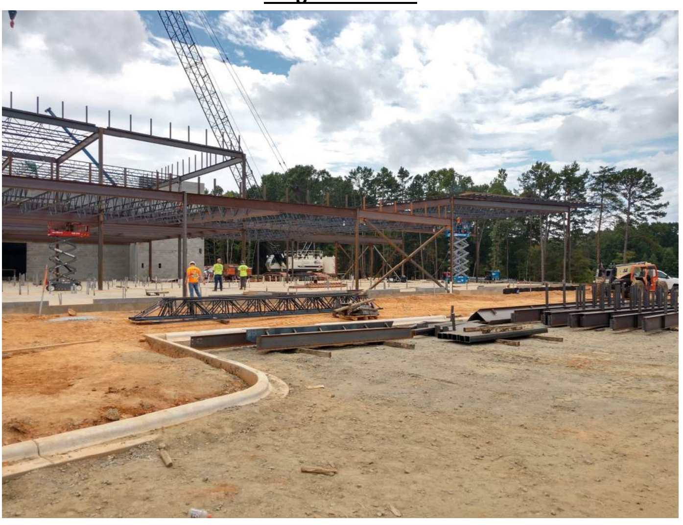
Area A: Steel near completion.