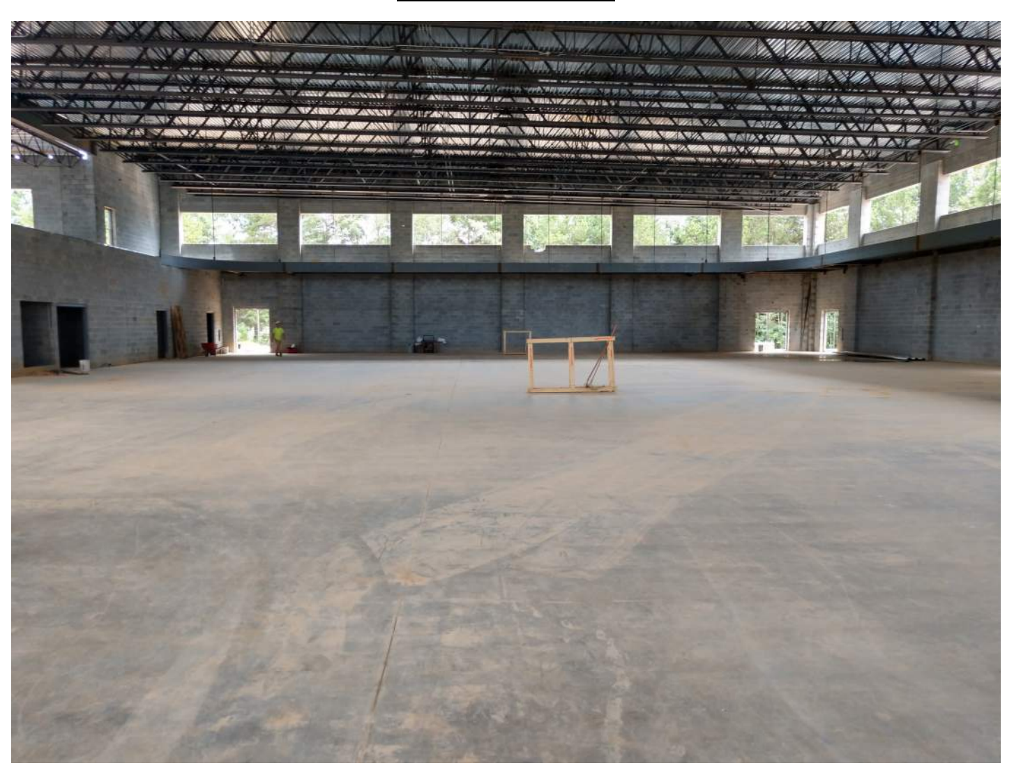
Area C-Gym roof joist & deck installed. Track steel being installed.